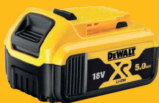
DCB184-XJ 18V XR 5.0 Ah battery