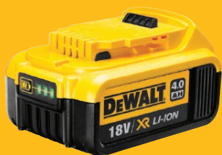
DCB182-XJ 18V XR 4.0 Ah battery