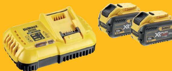
DCB118X2-QW Starter kit 2 x 9.0 Ah, 1 X DCB118