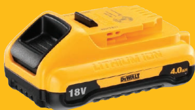
DCB189-XJ 18V XR 4.0 Ah battery