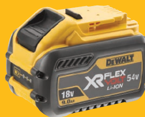
DCB547-XJ 18V/54V 9.0/3.0 Ah battery