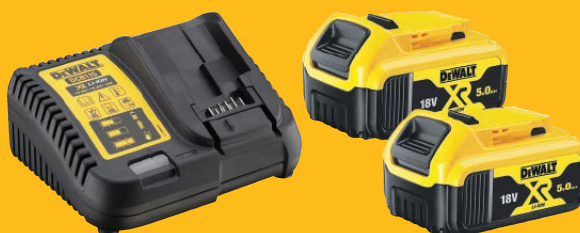
DCB115P2-QW Starter kit 2 x 5.0 Ah, 1 X DCB115