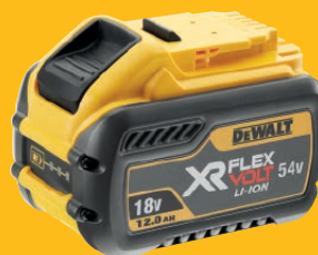
DCB548-XJ 18V/54V 12.0/4.0 Ah battery