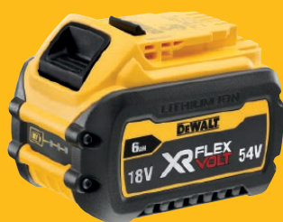
DCB546-XJ 18V/54V 6.0/2.0 Ah battery